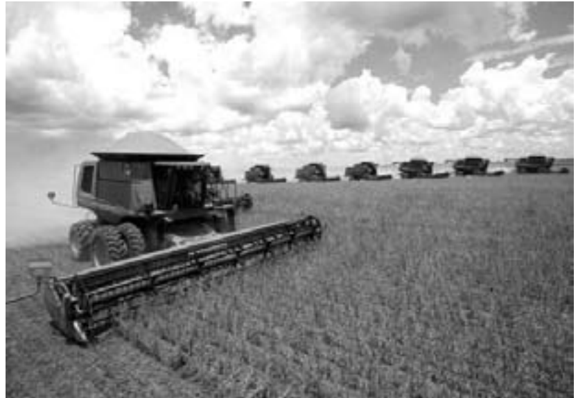
Could carbon offsets for agriculture lead to more energy intensive farming?