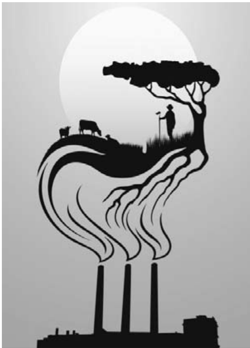
Carbon Offsets are, according to many, tantamount to Carbon Farming; farming purely for the incentive of offset payments.